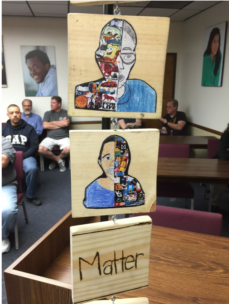
Shown are more plaques, depicting the various aspects of Briggs students.