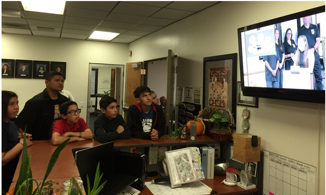
Briggs students in the district office lobby watch a television monitor of their classmates who were speaking to the board of education.