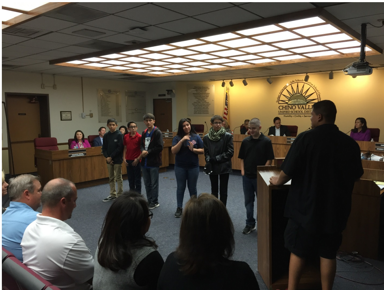
A Briggs student explains the video he and other students created, showing the process used during their study of chemical and physical properties.